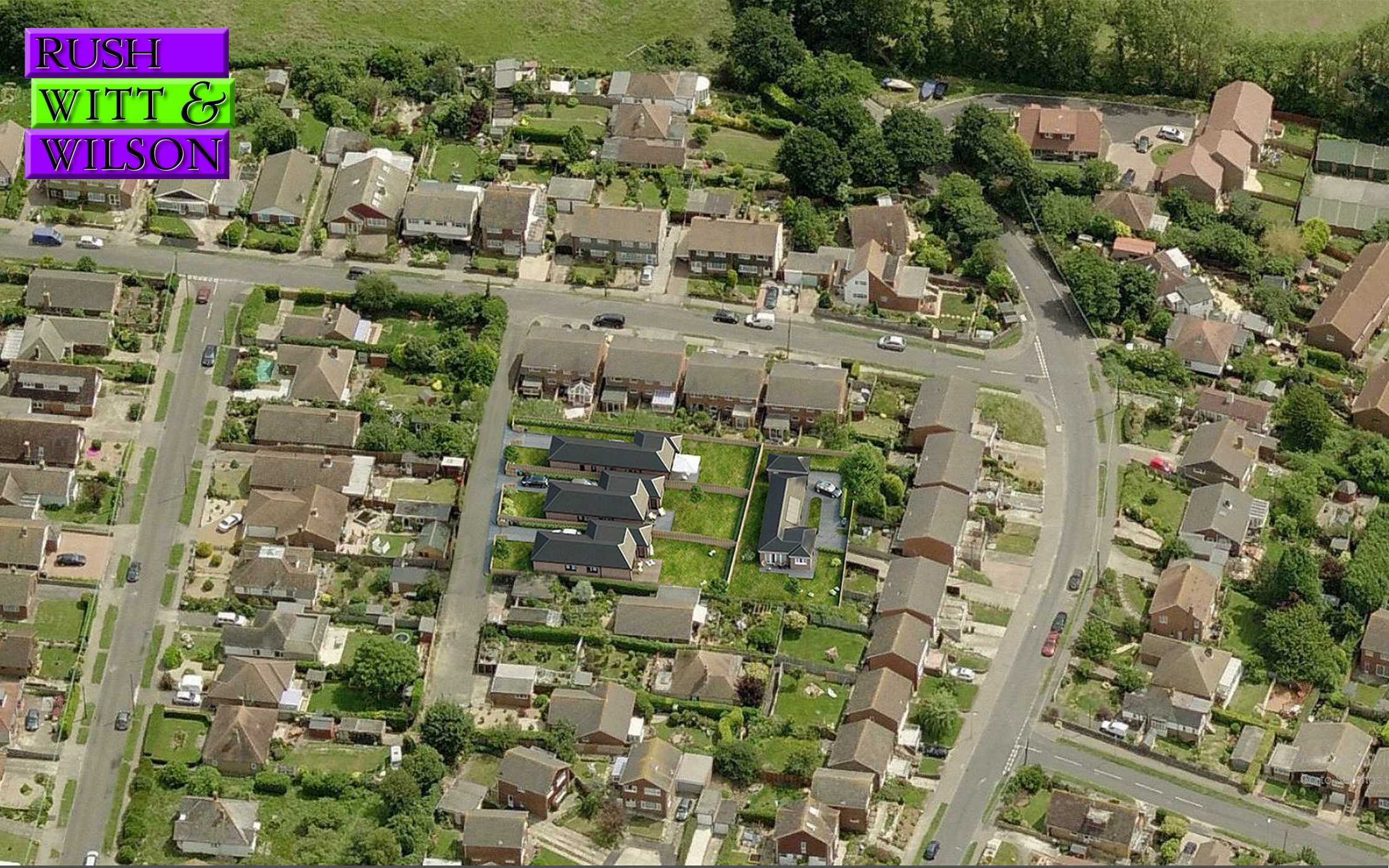
Plot 1 Filsham Lane, Bexhill-On-Sea, East Sussex TN40 2PZ £382,500